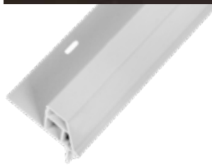
3/4 and 3/4J