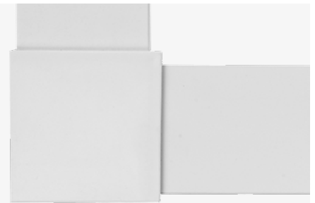
Colonial Casing with 45 Degree Corner