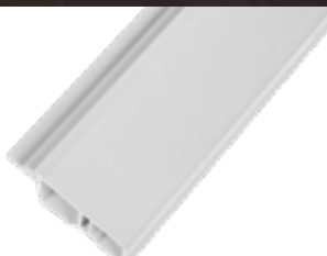
1" Sill Brickmould