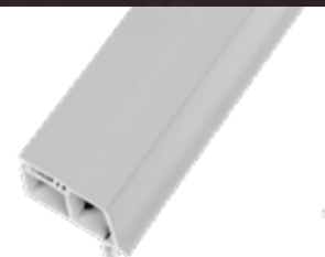
1" 1/4 1" 1/2