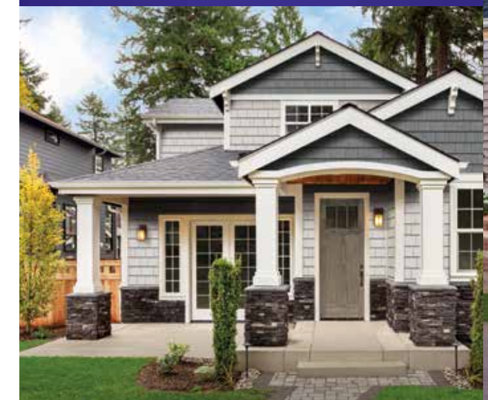
Portsmouth™ D5 Shake in Storm and Sterling, Trim in Antique White

For more information on installation instructions, product drawings, warranty documents and much more, visit us at RoyalBuildingProducts.com/for-professionals